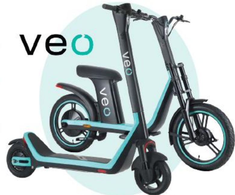
Astro Standing & Cosmo Seated Scooters